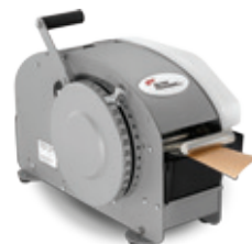
BP333 Plus with Heater