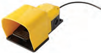
Optional foot switch with protective cover