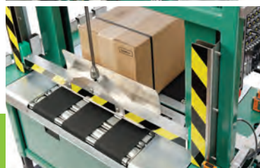
Optional bundle stop for precise positioning of loose loads