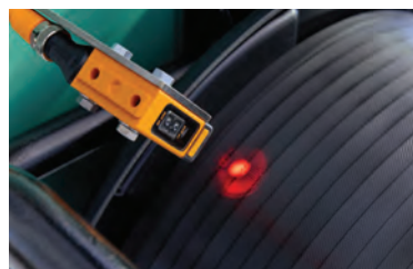
Low strap warning facility