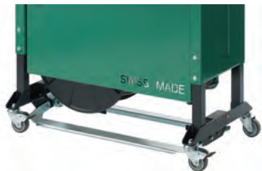
Optional second foot pedal for operation on both sides