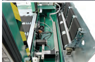
Easy access for service without tools